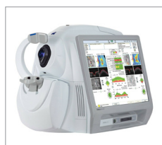
Models 5000 and 500