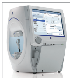
Models 840, 850 and 860