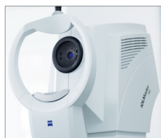
Models 500 and 700