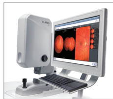
Models 500 and 700

Key Clinical Benefits – There are many factors that practitioners weigh before investing in technology. The following is an overview of ZEISS diagnostic solutions. Alongside each device is a list of clinical benefits and coding/billing information, including the Medicare National Average Physician Fee Schedule.*